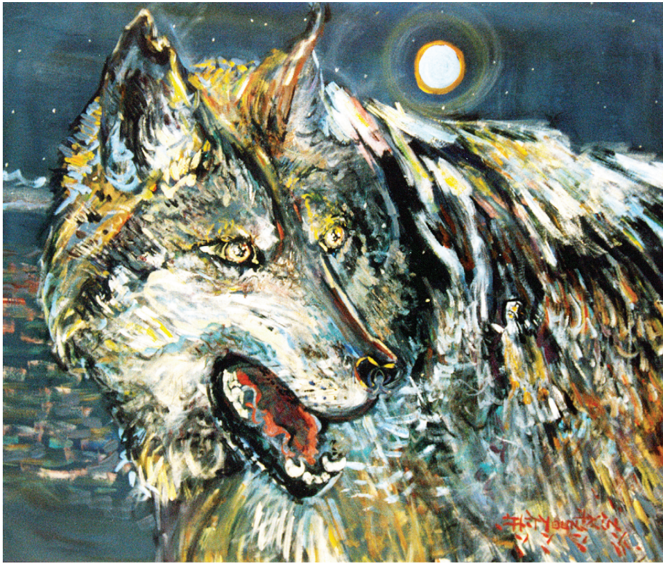
“Lords of The Tundra”